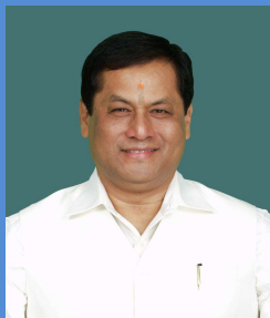
SHRI SARBANANDA SONOWAL